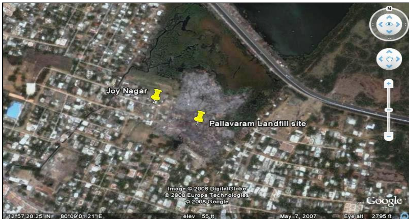
Fig.-2: Pallavaram Landfills site (Periyaeri) area and Joy Nagar in Pallavaram Municipality

Figure 2 shows the study area. The water samples collected from the Joy Nagar which is nearer to the solid waste dumpsite.